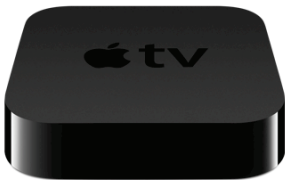
Models MD199 Date introduced March 7, 2012