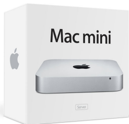
Mac mini with OS X Server retail packaging uses 15 percent less volume than the first-generation Mac mini Server and uses no expanded polystyrene (EPS).