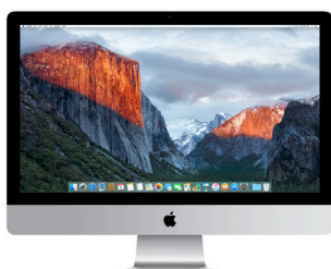
Models MK462, MK472, MK482 Introduced October 13, 2015