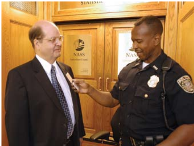
Guard protecting access to the NASS lockup area.