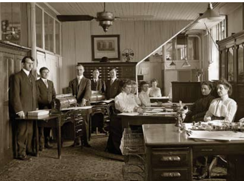
NASS office at USDA headquarters in Washington, D.C.—1910.

Golden Age of Agriculture. Between 1900 and the end of World War I, the demand for farm commodities increased, land values rose, and during part of the period, farm prices went up faster than nonfarm prices. The first two decades of the twentieth century became known as the golden age of American agriculture.