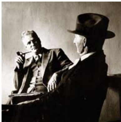
County Supervisor conferring with a farmer—1936.