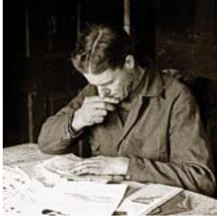
A farmer meticulously reviews his accounts.