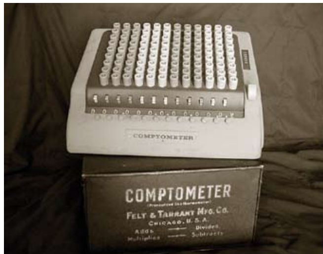
Comptometer, a mechanical calculator.

Post World War I Recession. Farm prices had been high during World War I because of European demand and government price fixing. By 1920, the European demand dropped and farm prices were determined by a free market. The urban economy was strong between 1922 and 1929, but agriculture did not share in the Nation's general prosperity. Farm income increased from $10 billion annually in 1919 to about $44 billion in 1921, and then plummeted and leveled off at about $7 billion a year from 1923 through 1929.