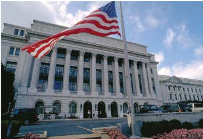
USDA Complex, Washington, D.C.

Partnering with the World Agricultural Outlook Board (WAOB). The WAOB, a unit of USDA's Office of the Chief Economist, was created to provide world supply and demand forecasts for major commodities by integrating information from NASS crop and livestock reports with a number of other sources. A forecast is in the form of balance sheets that matches supply—beginning stocks added to the anticipated crop—with demand—how much will be consumed at home, exported, or remain as ending stocks. When the WAOB convenes, interagency teams review and approve the commodity estimates and issue them as the monthly World Agricultural Supply and Demand Estimates report.