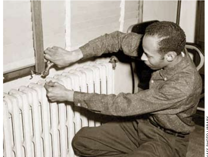
Securing window blinds.

The agency has in its history a misfortune—the 1905 inside trading scandal—that laid the cornerstone for creating the Agricultural Statistics Board. Today all survey data and summaries are controlled on a strict need-to-know basis and secured when not in use. Not even the Secretary of Agriculture or an Under Secretary will know a report's contents until entering the lockup area to sign it just before release.