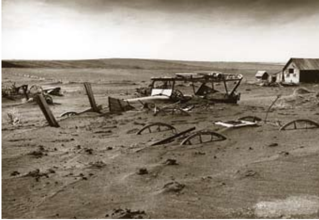
Machinery buried by blowing soil—1936.

Statistics for Drought Assessment. To add to the Depression woes of low prices, a severe and prolonged drought in the 1930s covered the Corn Belt and southern Great Plains. In 1934 the average corn yield of 16 bushels per acre was the lowest on record. Conditions improved somewhat in 1935, but 1936 was almost a duplicate of 1934. In large areas, crops were wiped out and pasture conditions were critical, creating a problem of saving livestock.