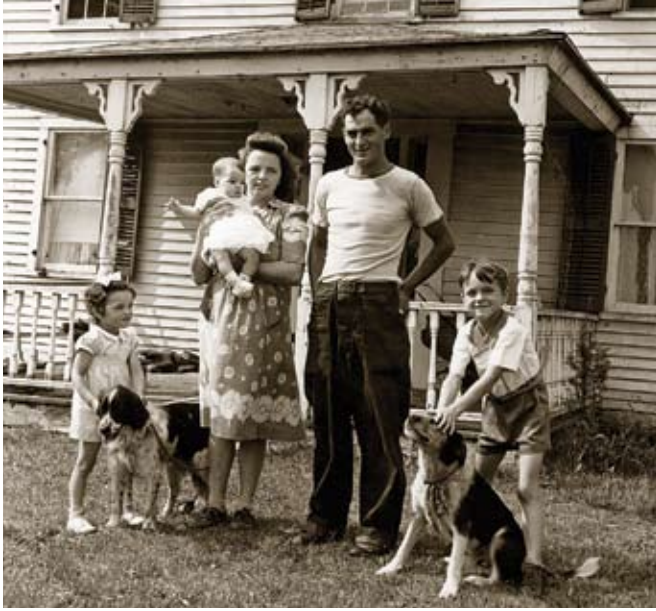
Young farm family—1940s.

Post-War Modernization of Agriculture. Post-war rising farm production was the result of many things, including the increasing use of improved mechanical equipment and introduction of improved varieties of crops and breeds of livestock. Modernization required the amount of capital to engage in farming to increase greatly. Prudent management became more dependent upon reliable statistics for market planning and operational decisions. Advantages of specialization became evident first by the chicken broiler industry where individual farm operations were replaced by chick hatcheries, feed processors, specialized housing, and poultry dressing plants.