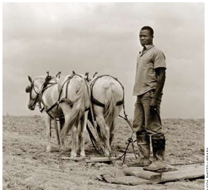
Farmer preparing cropland.

Texas longhorn cattle were driven along the Chisholm Trail, the major route north. The cattle boom accelerated settlement of the Great Plains and sometimes fueled range wars between farmers and ranchers.