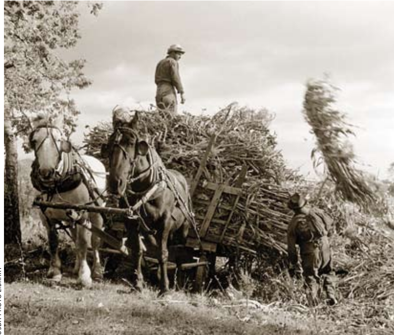
USDA PHOTO LIBRARY

First Agricultural Census. In 1839, Commissioner of Patents Henry Ellsworth prevailed upon Congress to designate $1,000 for "carrying out agricultural investigations, and procuring agricultural statistics." Then, in 1840, detailed agricultural information was collected through the first Census of Agriculture, which provided a nationwide inventory of production. Using the census information as a benchmark, Ellsworth used other annual data to make agricultural estimates for each year between the 10-year census cycle.