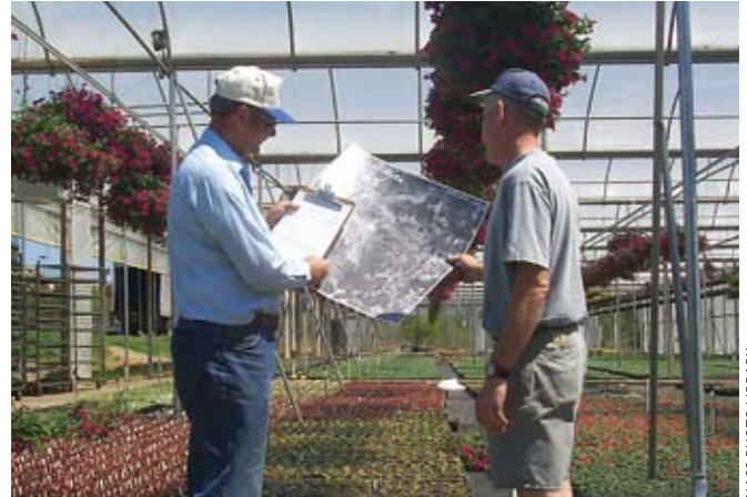
Enumerator interviewing a greenhouse operator.

The National Association of State Departments of Agriculture (NASDA). NASDA provides grassroots support for the NASS mission by employing part-time field and office enumerators to collect survey data by telephone or in person. This partnership allows the NASDA