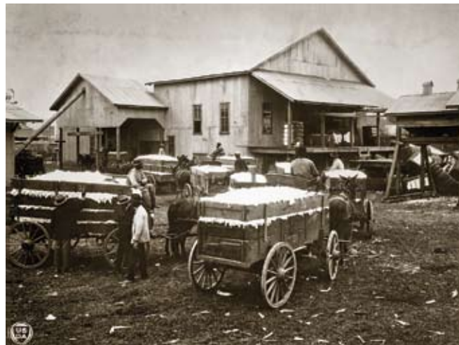
Cotton gin, Madison County, Alabama.

USDA and Division of Statistics Established. In 1862, President Abraham Lincoln established the USDA, which he called “The People's Department.” Trade and commodity buyers had more current and detailed market information than did the isolated farmers, which prevented farmers from getting a fair price for their goods. The new agricultural statistics program would provide sellers and buyers equal information.