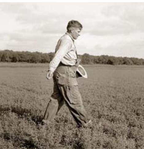
Spreading grasshopper bait in Oklahoma—1937.

Weekly and semi-monthly reports were called for to answer questions about how much feed was available and where and how many cattle and hogs were involved. The Drought Relief Act appropriated disaster-type loans to farmers for planting crops or feeding livestock, but in actual practice some of the money went for family living expenses.