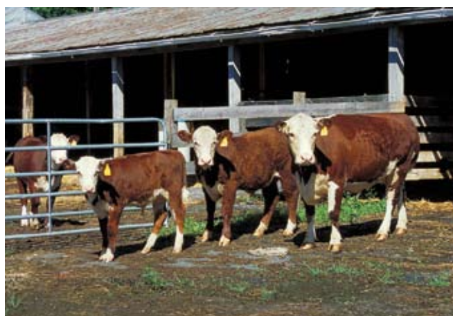
Hereford cattle in Anne Arundel County, Maryland.