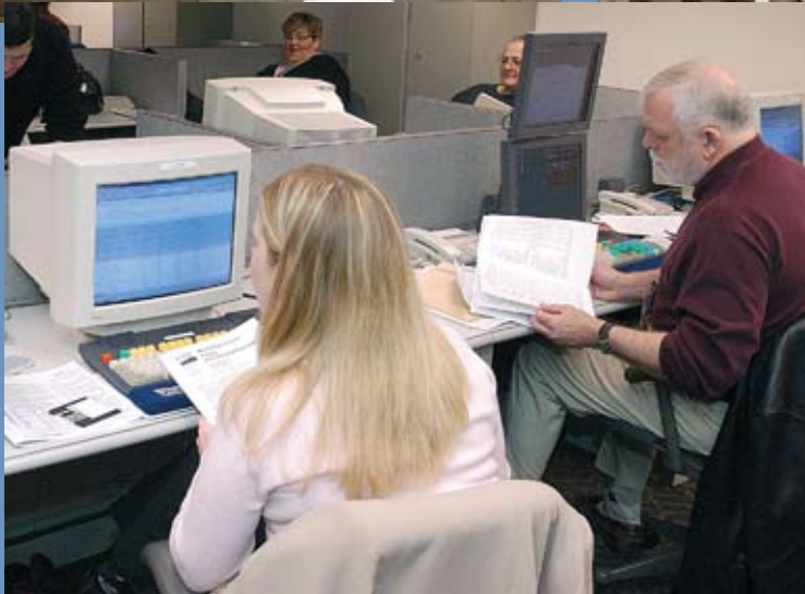
NASS PHOTO LIBRARY