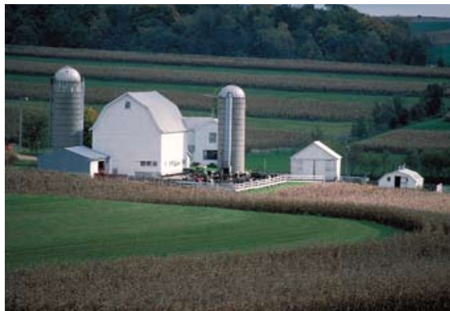
Green County, Wisconsin farm.

Rural Way of Life. Throughout U.S. history, farming has not only been an important economic activity, but also a distinctive way of life. The traditions and values associated with farming and the rural way of life still prevail in a society that has become predominantly urban.