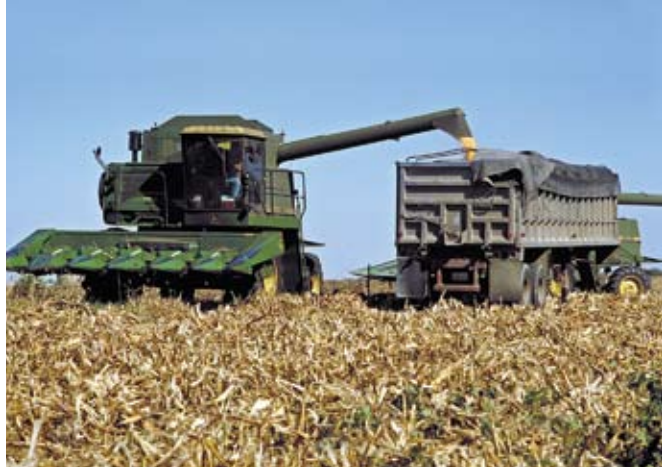
Harvesting corn near Stockton, Kansas.

Overvalued Land Creates Crisis. For a number of years in the 1970s, American landowners saw the prices of farmland increase in value beyond the capacity of the land to produce adequate income to pay for the loans. However, through refinancing purchased land, producers were able to buy even more farmland. When inflation slowed, overleveraged producers and the rural banks that had made the loans faced a financial crisis. By 1987, farmland values bottomed out after a 6-year decline.