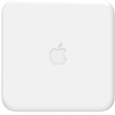
The exterior of the Apple Watch carrying case is composed of 50 percent post-consumer recycled polycarbonate.