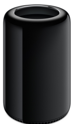
Models ME253, MD878 Date introduced October 22, 2013