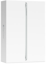
Retail packaging for iPad mini 4 uses a minimum of 38 percent post-consumer recycled content.