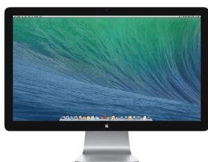
Model MC914 Date introduced July 20, 2011