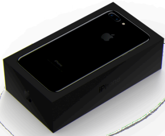
U.S. retail packaging of iPhone 7 Plus contains 86 percent less plastic than the previous-generation iPhone packaging and contains 60 percent recycled content.