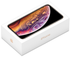
U.S. retail packaging of iPhone XS contains 54 percent recycled content.