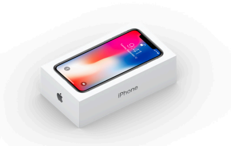
U.S. retail packaging of iPhone X contains 55 recycled content.