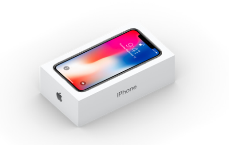
U.S. retail packaging of iPhone X contains 55 recycled content.