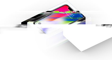
U.S. retail packaging of iPhone X contains 55 percent recycled content.