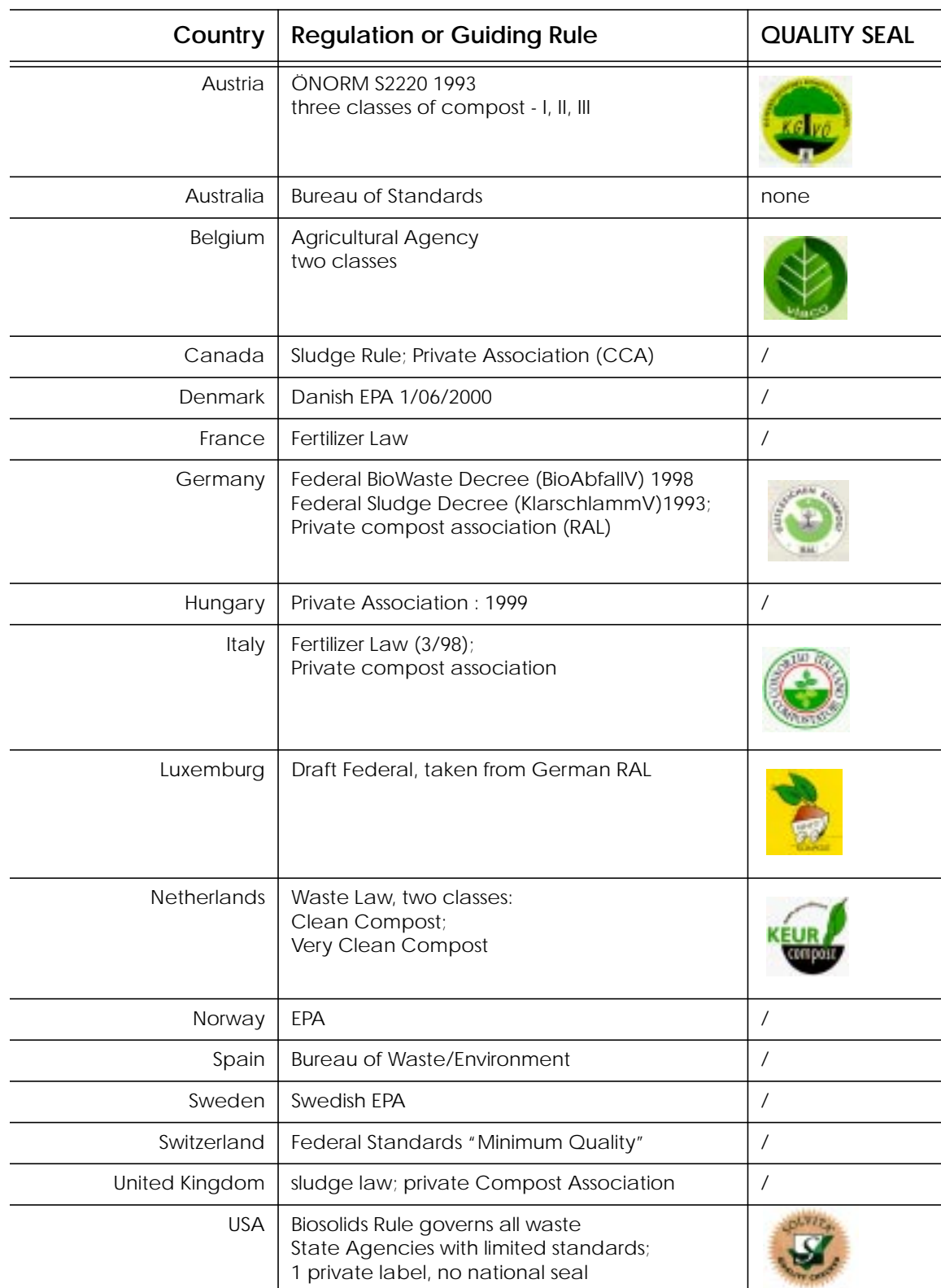
Table 2: Status of Compost Quality Seals by Country (Modified, after Centemero, 1999)