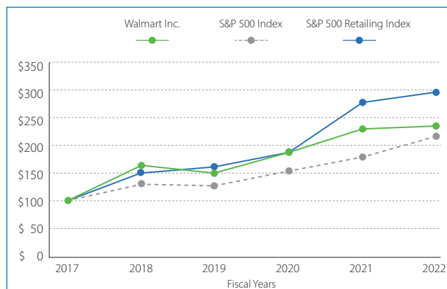
Comparison of 5-Year Cumulative Total Return* Among Walmart Inc., the S&P 500 Index and S&P 500 Retailing Index

*Assumes $100 Invested on February 1, 2017